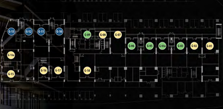
Built Up Sizes